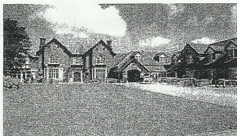
Exhibitor Entry Form